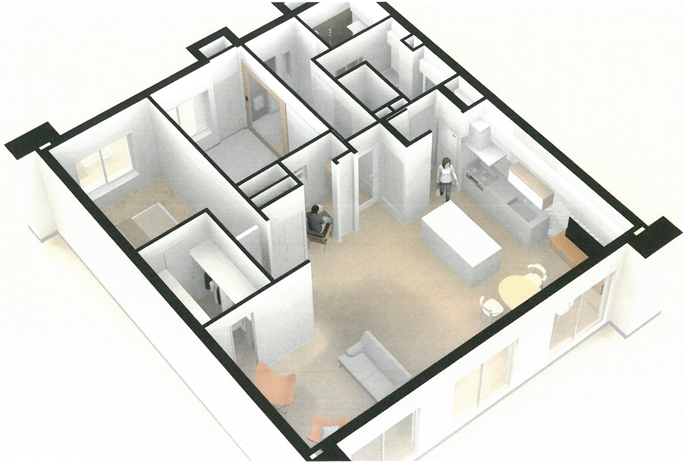
project image 2