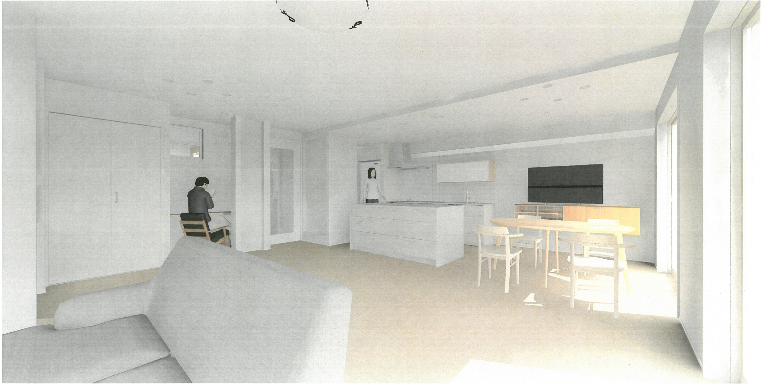
project image 1